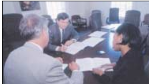
To be effective, board members must have a solid grasp on co-op financial statements. Request to meet with the co-op manager or accountant if you need more background on how to read them.

The membership of most cooperatives is not homogeneous. Each member has an interest in the cooperative. These interests differ to some degree, sometimes dramatically from other members. Members may have differing planning horizons, as would be the case between someone just starting in the farming business and someone contem-